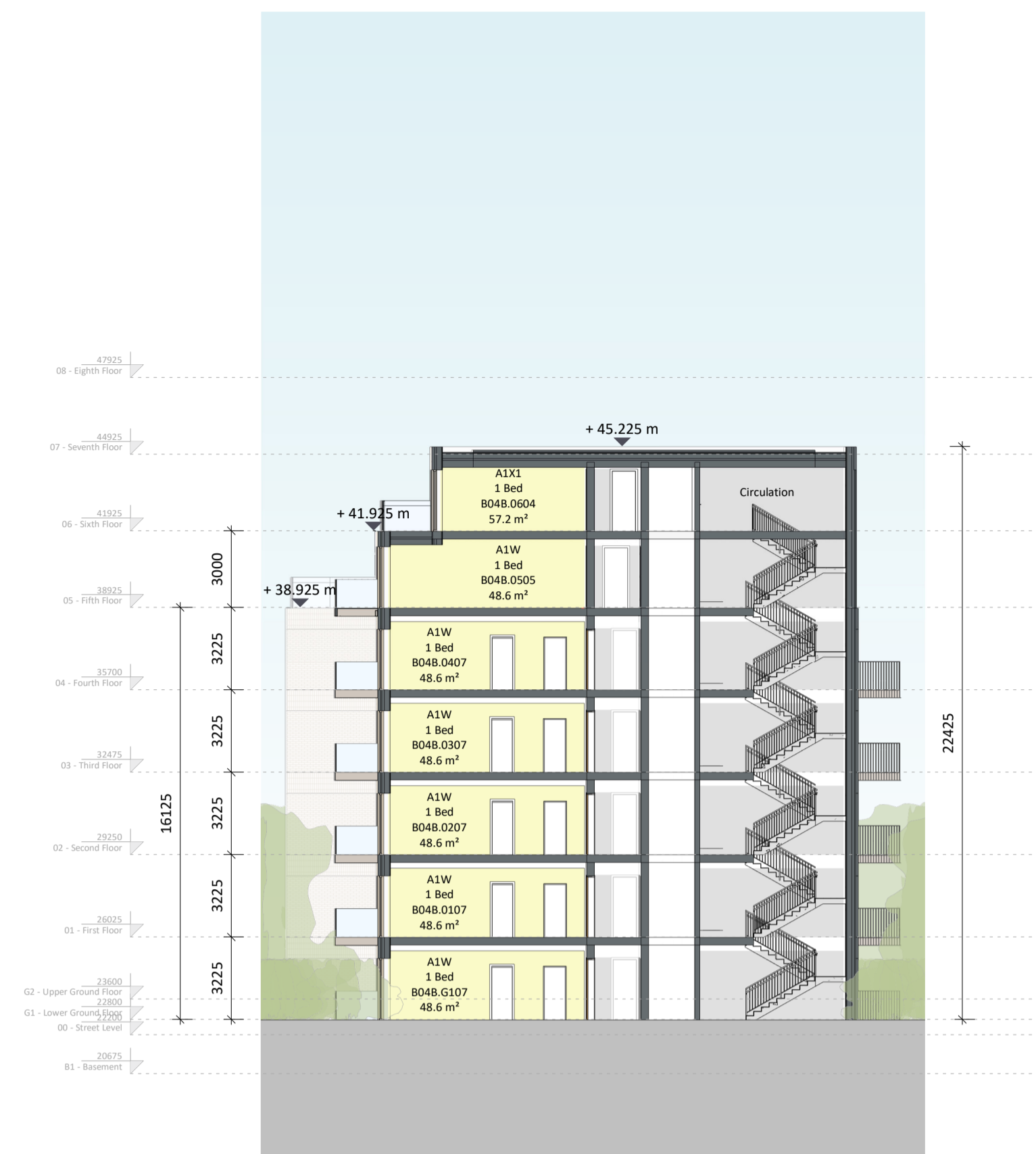
② Block 04 E/W Section 1:200