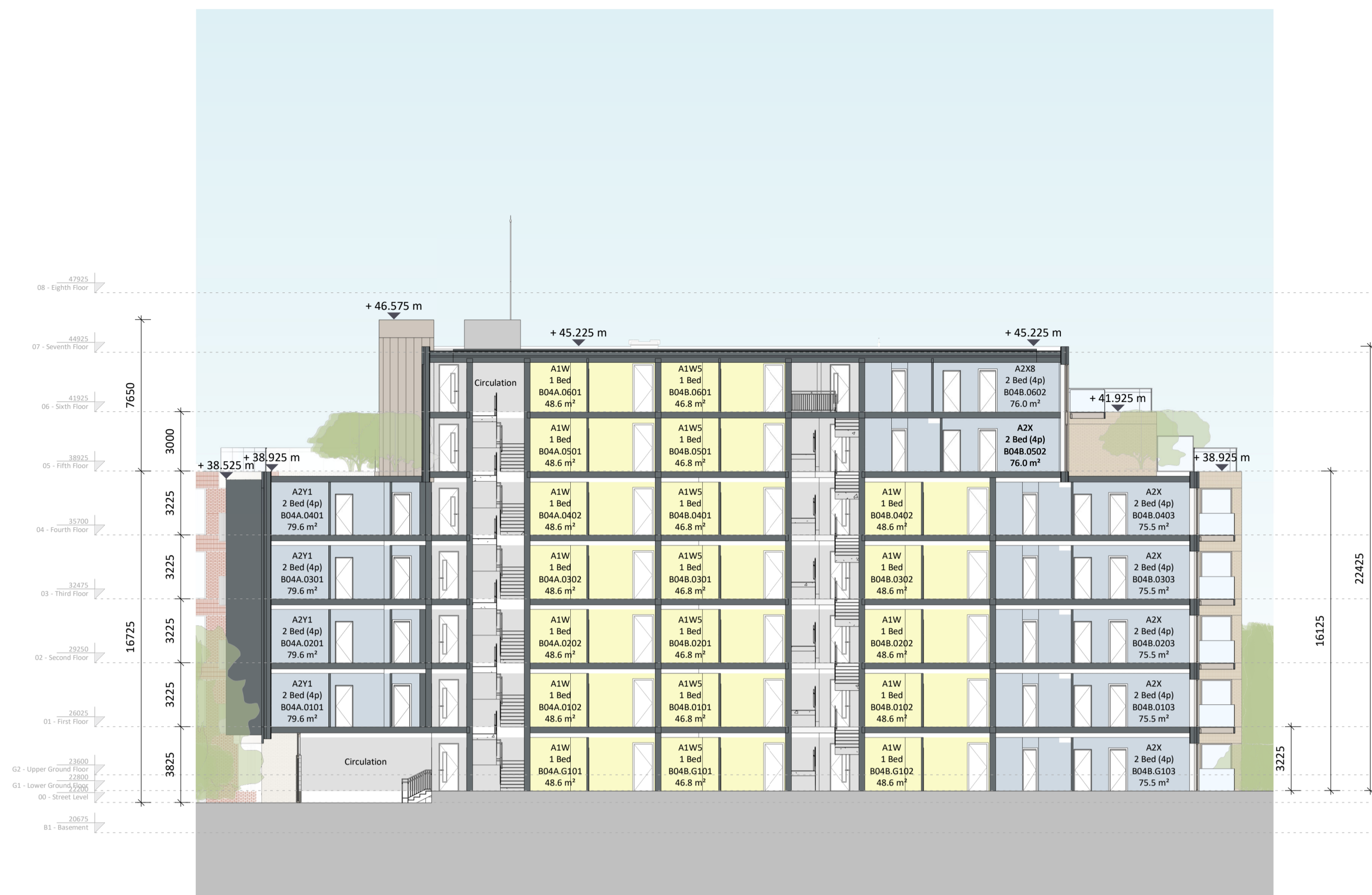
① Block 04 N/S Section 1:200