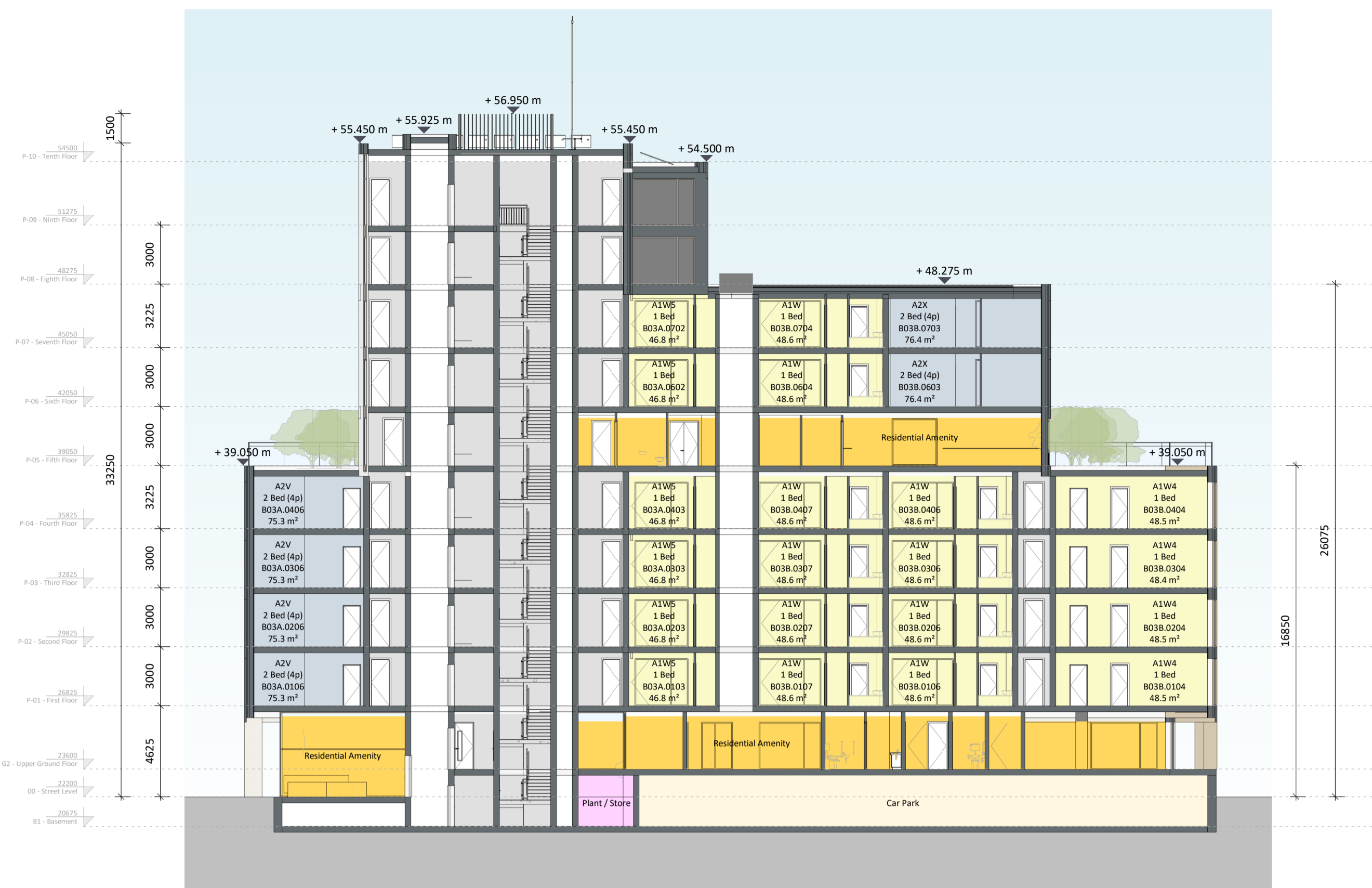
① Block 03 N/S Section 1:200